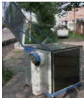
“Solar Drying Box”

In addition, solar drying can be easily found in some western areas in China where people using solar drying oven to dry agriculture products, such as fruits and vegetable, teas, flowers, teas, mushrooms, noodle, fish and shrimps, and so on. Through solar drying the indirect income generation is achieved by saving fuels such as coal and firewood. For examples, farmers use solar drying technology to dry medlar in Ningxia region and farmers use solar drying technology to dry grape in Xinjiang region.